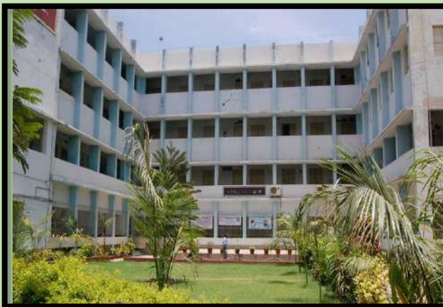
N.S. Patel Arts (Autonomous) College